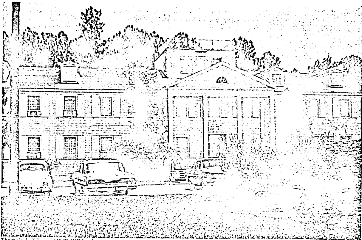
The main building of JM WAVE headquarters, on the South Campus of the University of Miami.