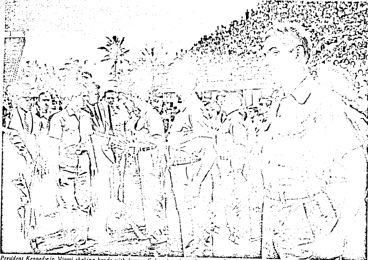
President Kennedy in Miami shaking hands with former Cuban invasion prisoners on December 29, 1962.